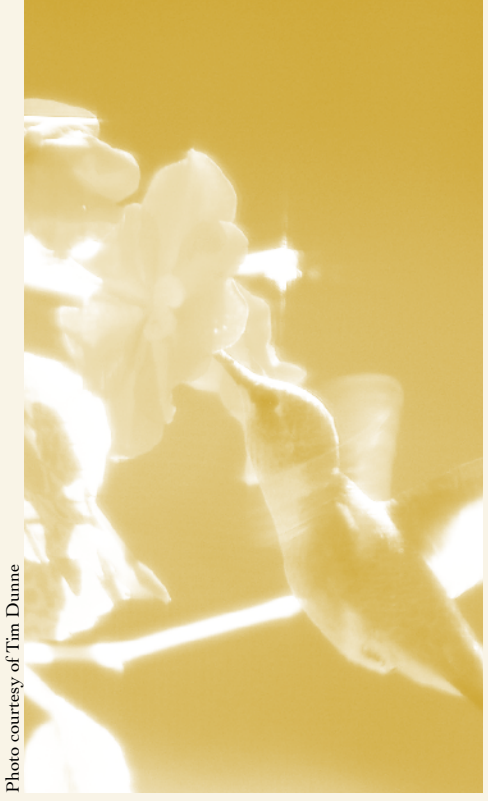
Ruby-throated Hummingbird, a summer species in the Manitoulin-Lake Simcoe ecoregion.